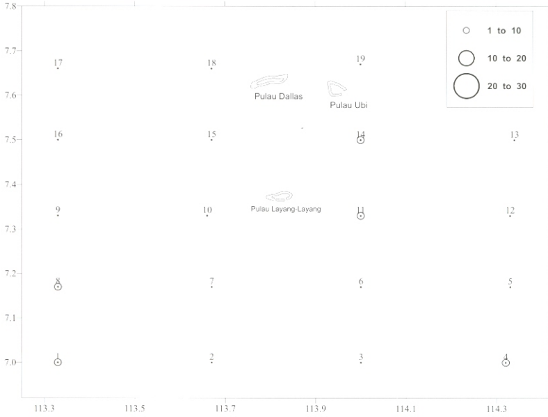
Figure 7: Abundance and distribution of Scombridae larvae (No./100 m3)