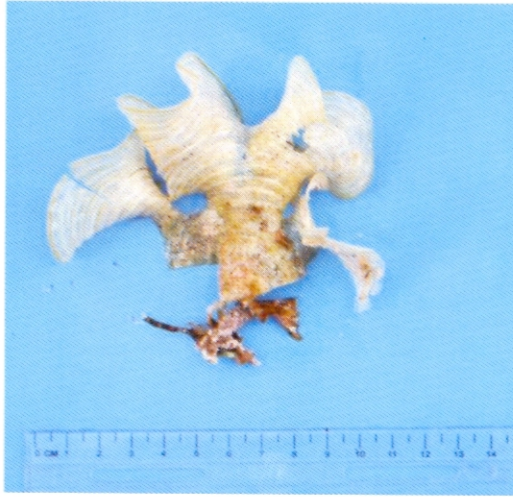
Figure 13: Padina minor Yamada habit. The surface of the blade is divided into concentric zones by hair lines which are equidistant from each other. Based on description of Trono (1997)